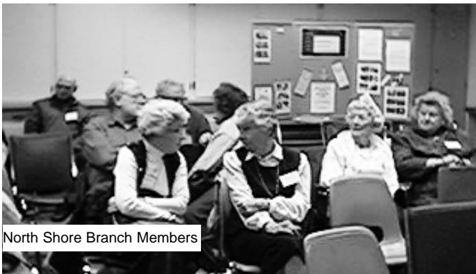
North Shore Branch Members