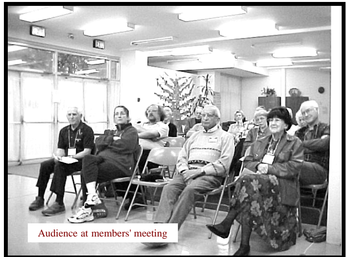
Audience at members' meeting

Everyone has the occasion to travel at some time or other. Being away from familiar surroundings can present challenges for just about anyone, but the hard of hearing, particularly, face additional difficulties that hearing persons don't have to think about. Unfamiliar voices, foreign accents, acoustically unfriendly environments, such as, aircraft, buses, hotel lobbies, restaurants, noisy streets to name just a few, and of course, the additional worry that we may not hear things like fire alarms, announcements or pages.