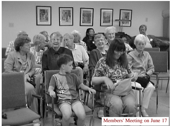
Members' Meeting on June 17

The excerpts which were shown at the meeting were: Restaurants, Airline Travel, Hearing Aids, Assistive Listening Devices and Hearing Dogs.